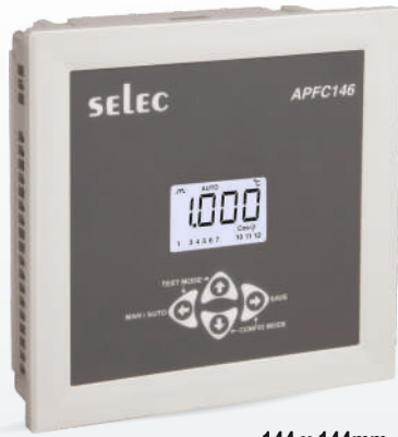
144 x 144mm