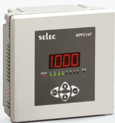
144 x 144mm