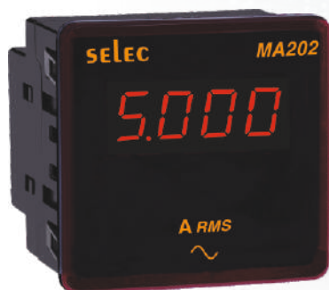
72 x 72mm