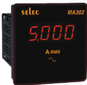
96 x 96mm