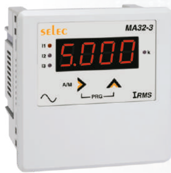
96 x 96mm