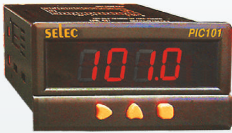
48 x 96mm