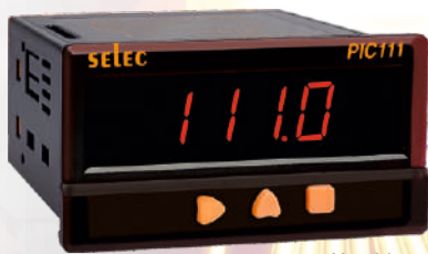
48 x 96mm