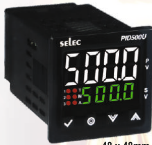
48 x 48mm