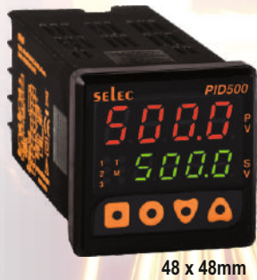
48 x 48mm