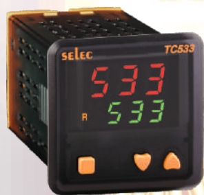
48 x 48mm