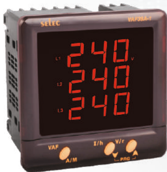
96 x 96 mm